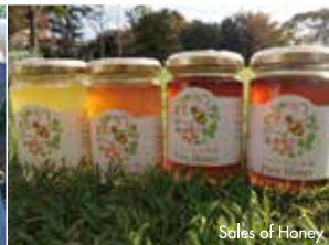
Sales of Honey