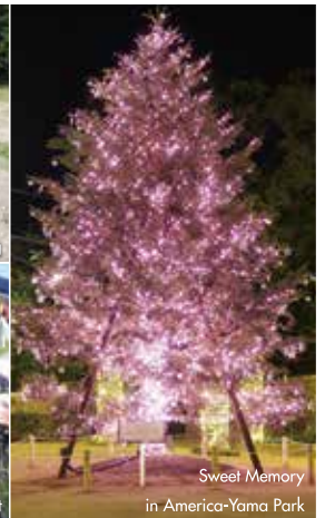
Sweet Memory in America-Yama Park