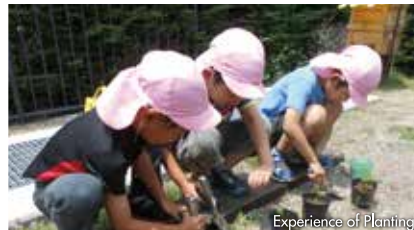
Experience of Planting