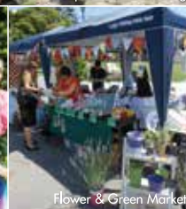
Flower & Green Market